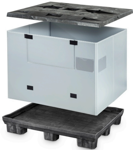
Image 2: Thanks to its injection-molded production process, the CabCube 2.0 impresses with robustness, dimensional accuracy, and high durability.