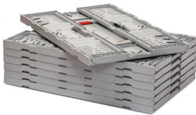
Image 1: When the Twistlock Box is folded, it is only 28 mm tall. This significantly reduces process costs and CO 2 .