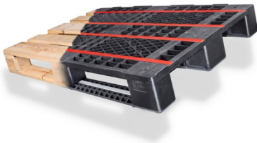
Image 2: The Euro E7 offers the advantages of both wooden and plastic pallets

Image 1: When the Twistlock Box is folded, it is only 28 mm tall. This significantly reduces process costs and CO 2 .